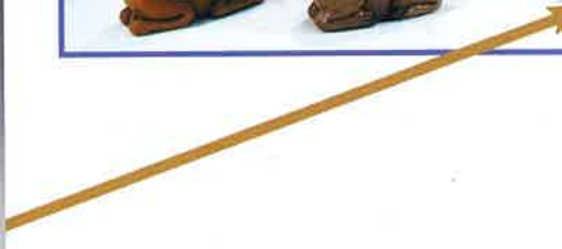
Pattern on Page 78